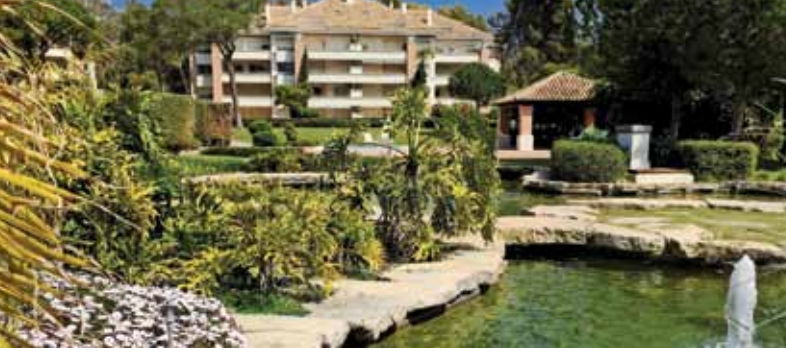
SPAIN, MARBELLA, GOLDEN MILE

Luxurious 3 bed flat in La Trinidad 5 star complex ◆ 24hr security ◆ walking distance to beach and Puente Romano Hotel ◆ built: 198 sq m ◆ terrace: 33 sq m Guide €1.395 million