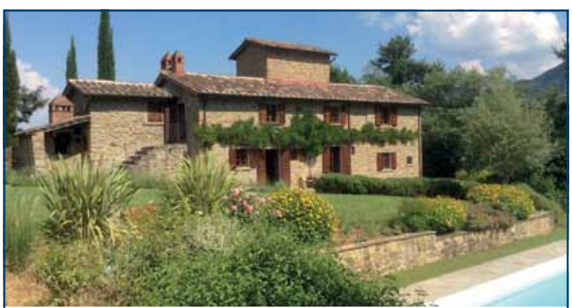
ITALY, TUSCANY, CORTONA

About 2.3 ha Guide €2.3 million adudley@savills.com +44 (0)20 3813 3840