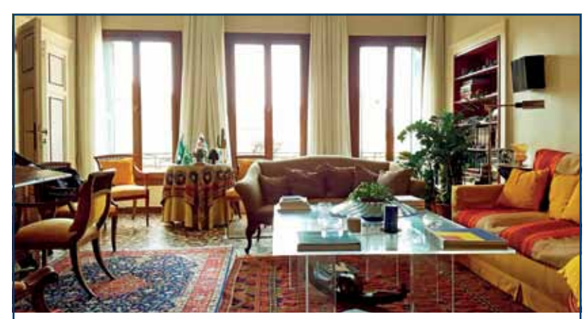
ITALY, VENICE, DORSODURO