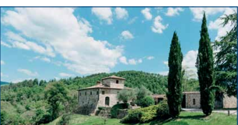
ITALY, TUSCANY, GAIOLE IN CHIANTI

Luxurious Leopoldina stone farmhouse ◆ 4 reception rooms ◆ 7 bedrooms ◆ 7 bathrooms ◆ guest annexe ◆ swimming pool ◆ hot tub