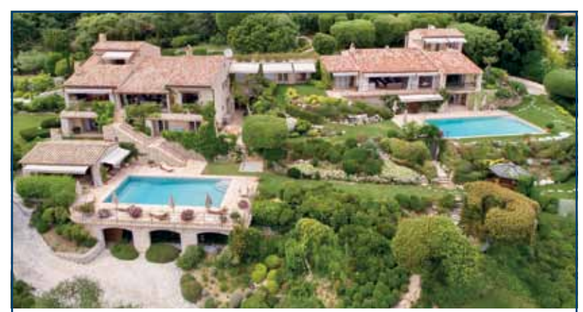
FRENCH RIVIERA, ST PAUL DE VENCE

Select gated estate in sought after location ◆ elegant family home of generous proportions ◆ 8 beds ◆ 2 swimming pools ◆ landscaped grounds ◆ panoramic views Guide €7.95 million