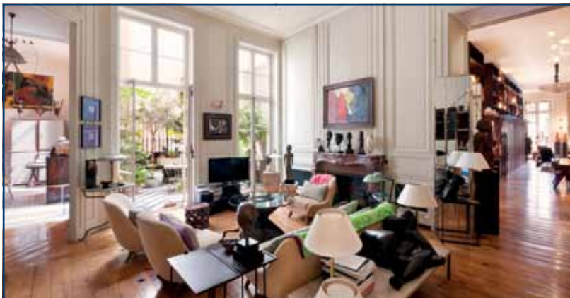
PARIS, FAUBOURG SAINT HONORE, 75008

restaurant ◆ Cortona: 15km Guide €5.6 million adudley@savills.com +44 (0)20 3813 3840